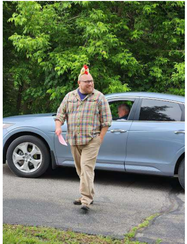
June 7th Brooks BBQ