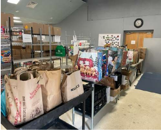
HUPC's Donation to the Food Bank!